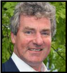
East Surrey MP Peter Ainsworth

At eight minutes past two on Saturday afternoon parents and pupils attending Lingfield and Dormansland Primary Schools, resplendent in orange T-shirts, will march through Lingfield.